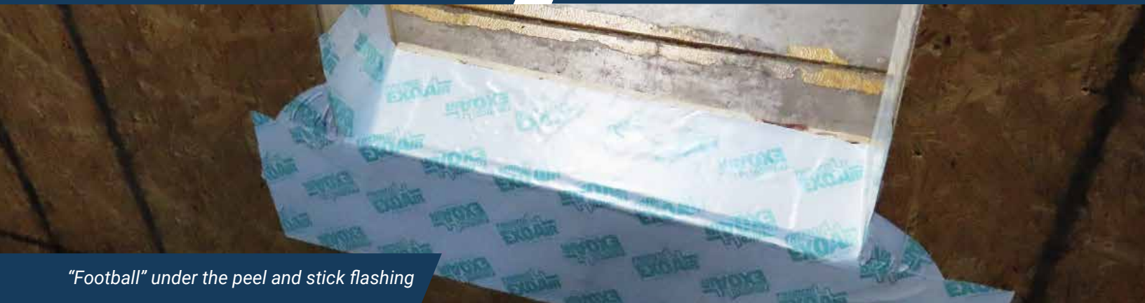
“Football” under the peel and stick flashing

The “Bow Tie” is thinner at the middle, which is where the coverage must happen for this detail to work successfully. It is easy for the installer to mistakenly make the middle too thin or stretch the membrane and therefore, the inside corner might not have proper coverage of the membrane.